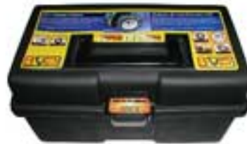
A must for all ATV plow owners