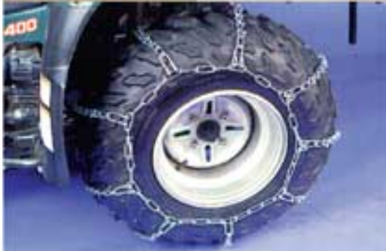
2 spaces chain